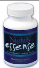
Item# 65002 - 62 Capsules