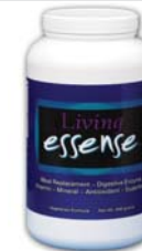
Item# 65200 - 31 Servings

This perfect meal replacement will act as a key part of a comprehensive weight-management program. This product contains all the basic ingredients, but takes nutritional shakes to a whole new level by including a comprehensive panel of vitamins, minerals, antioxidants, and green superfoods. If that wasn't enough, you'll find the most extensive profile of digestive enzymes (15) ever offered that will guarantee that all of the nutrients in this product will be digested and assimilated in short order!*